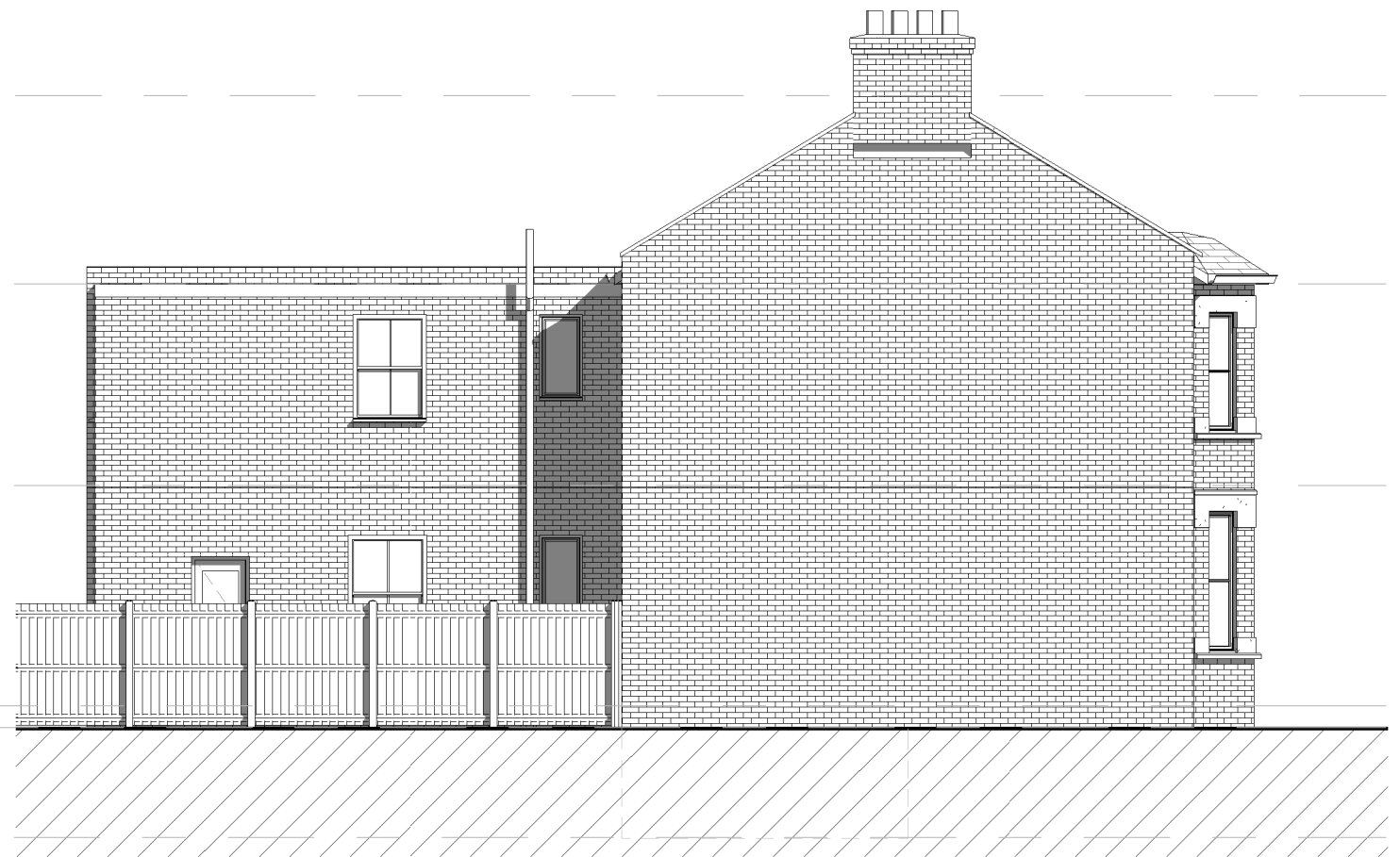
Existing Side II Elevation. 1 : 100